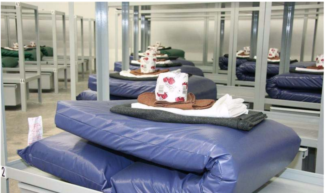
36 double bunks were bolted to the floor to allow for up to 72 inmates.