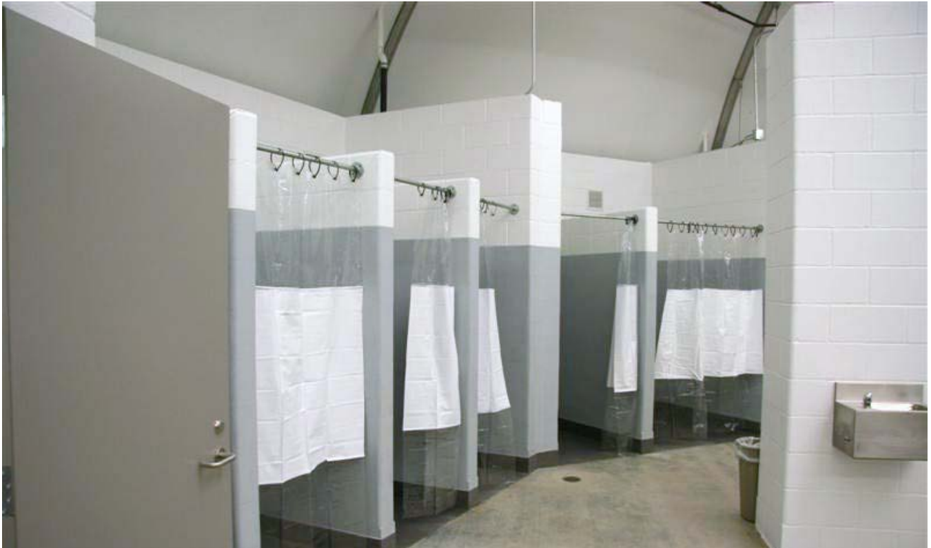
Regular amenities like showers, sinks and washing machines are easily incorporated into the overall design of the building.