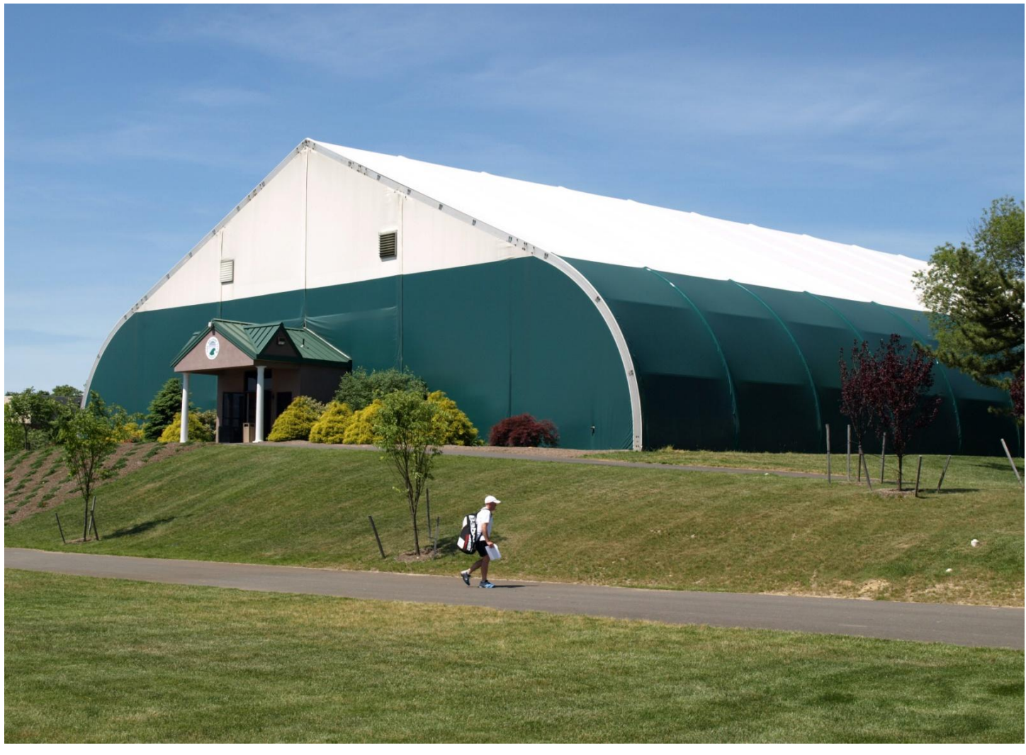
The Atlantic Club Tennis Building 2, Built in 1999.

For over 25 years UFS has been offering quality structures engineered for sport and recreation facilities. The SPORTHALL® provides for a clean, bright, open air environment with the feel of being outdoors – the perfect solution for bringing an outdoor game or activity into an indoor environment. The custom shapes, aesthetically pleasing design, retractable wall systems, and translucent roof complement any surrounding to create a unique indoor-outdoor environment for year-round use. SPORTHALL® - We've Got You Covered